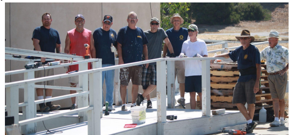
San Luis Rey ROTARY AT WORK 2014